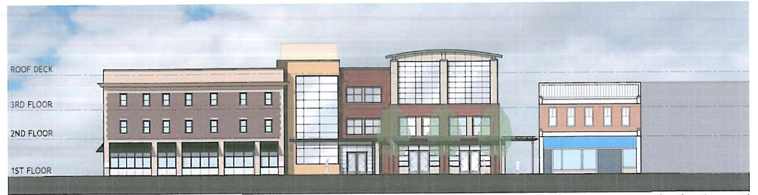
1 - EAST ELEVATION