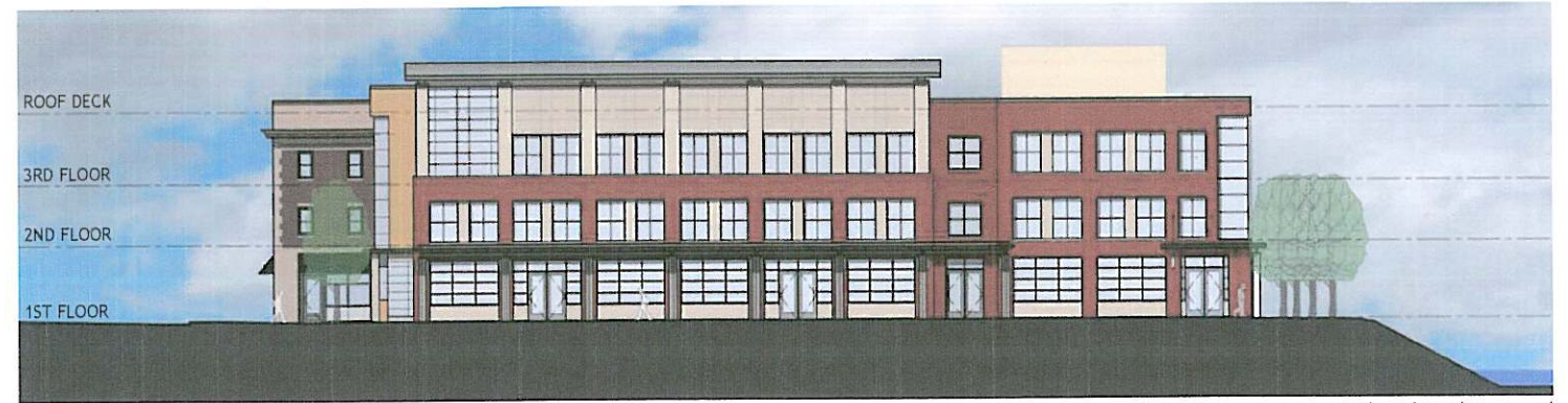
2 - NORTH ELEVATION