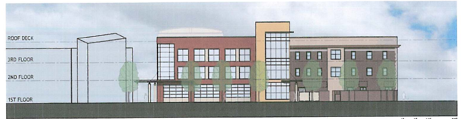
3 - WEST ELEVATION